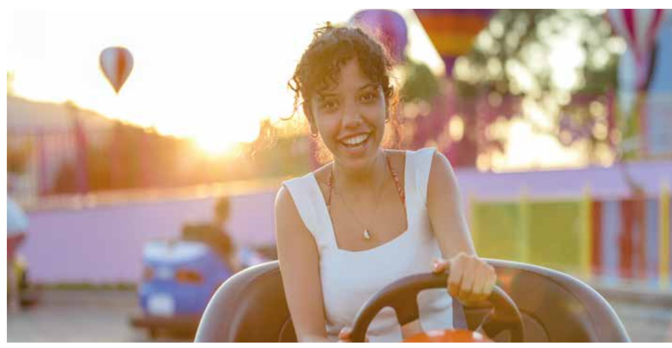
PLEASE NOTE THAT SUPREME PARK OPENING HOURS AND DATES MAY VARY DEPENDING ON WEATHER CONDITIONS AND HOTEL OCCUPANCY.