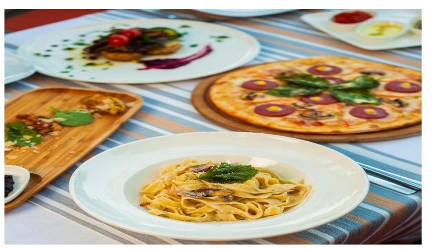
Services With Extra Charge