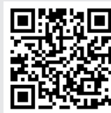
MP Hotels Brochure

/labrandalebedosprincess /labrandalebedos