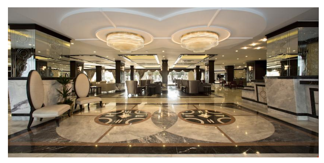
Le Monde Beach Resort & Spa