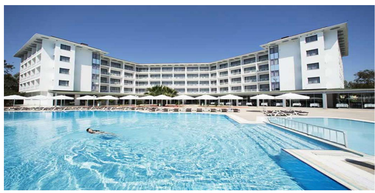
Le Monde Beach Resort & Spa

Cumhuriyet Mahallesi Çetin Emeç Caddesi No : 2 Dikili / İZMİR