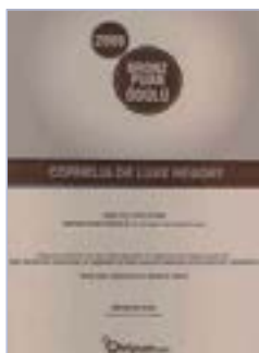
OTEL PUAN – BRONZE AWARD