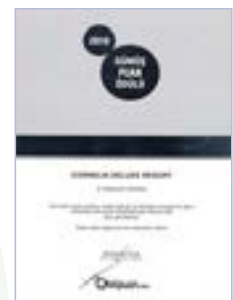
OTEL PUAN – SILVER AWARD