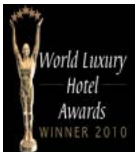
BEST LUXURY COASTAL HOTEL