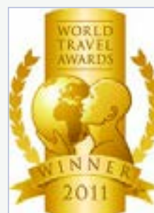
WTA – Europe's Leading Golf Resort