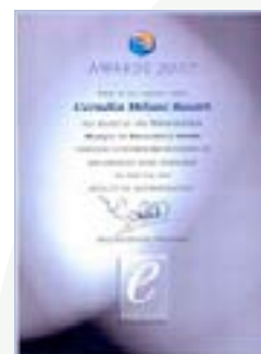
THOMAS COOK - MARQUE of EXCELLENCE