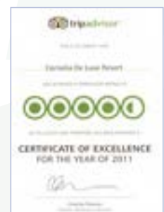
TRIPADVISOR – CERTIFICATE of EXCELLENCE