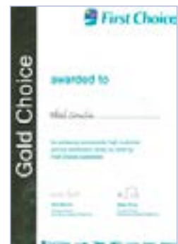
FIRST CHOICE – GOLD CHOICE