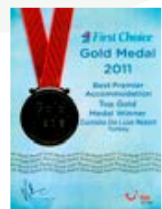
FIRST CHOICE – TOP GOLD MEDAL