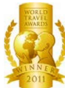
WTA – Turkey's Leading Golf Resort