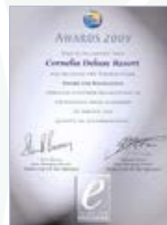
THOMAS COOK - AWARDS for EXCELLENCE