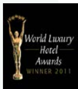
BEST LUXURY COASTAL RESORT