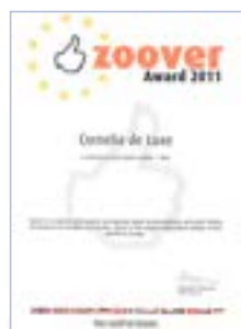
ZOOVER – BEST HOTEL BELEK