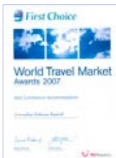
FIRST CHOICE – WORLD TRAVEL MARKET AWARDS