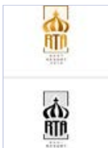
RUSSIAN TRAVEL AWARDS – Best Resort