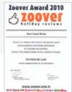
ZOOVER – BEST HOTEL BELEK