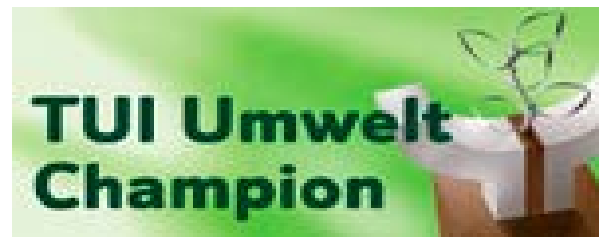
TUI – Environmentally Friendly TOP 100 Hotels Worldwide